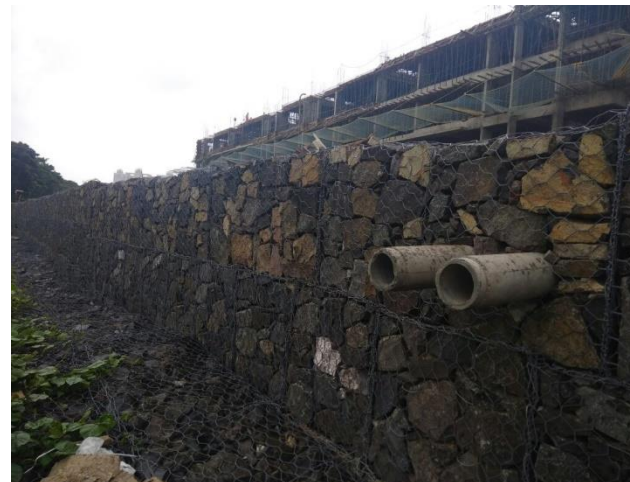
Gabion wall with pipe line